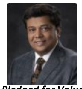
Pledged for Value

SAP | Oracle | Microsoft Sales Force | Learning Portal Portals | Dot Net | Visual Basic Mobile App | IoS | Android Project Management Service Desk