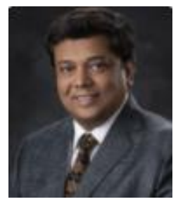
Pledged for Value

Spectr. Labs was incorporated in 2019 by IT experts carrying over 20 years of experience in spectrum of technologies while working with leading consulting companies in Europe & USA with fortune 500 clientele